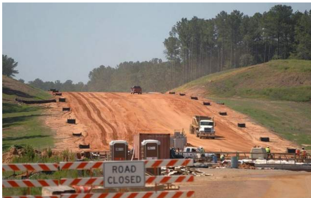
Work is ongoing at the new East Metro Parkway in Flowood, which is slated to connect Lakeland to I-20. The overall project, also touching Pearl and Brandon, is to be built in several phases. The portion in Flowood should be open in about a year.

Recommend Be the first of your friends to recommend this.