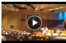
Clinton music minister admits sexual misconduct... Aug 10, 2011